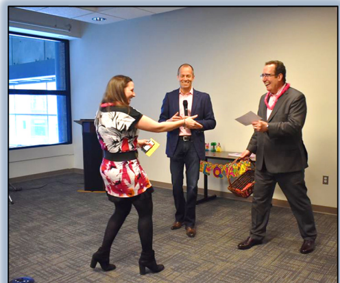
The 2017 Staff Appreciation Day featured a catered breakfast, a raffle, recognition of Firm anniversaries, and relaxing manicures and massages for hardworking staff.