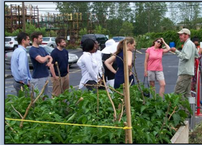
Bodman's Pro Bono Committee and the 2016 summer associates tour Detroit's Capuchin Soup Kitchen facilities, where Bodman attorneys help serve the legal needs of Metro Detroit's 35,000 homeless.