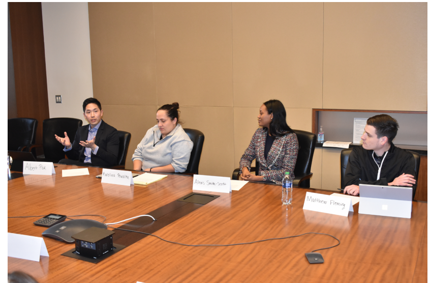
Panelists at the Wayne Law event

At both events the law students had an opportunity to ask the attorneys questions about their career journeys, law firm expectations of associates, how to stand out during on-campus interviews, and work-life integration. The attorneys also shared candid insights on what the practice of law is really like and how students can best prepare themselves for a successful legal career.